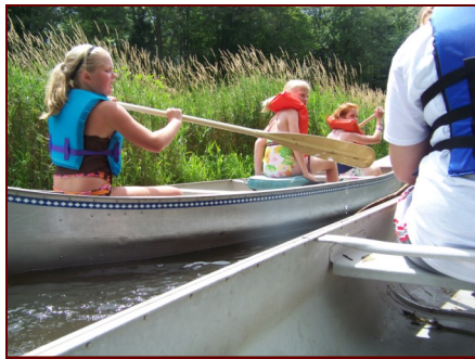
Canoeing down the Pigeon River during Bridging Out