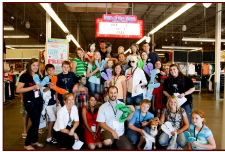
Bridging Out goes to Old Navy Camp to learn much needed job skills