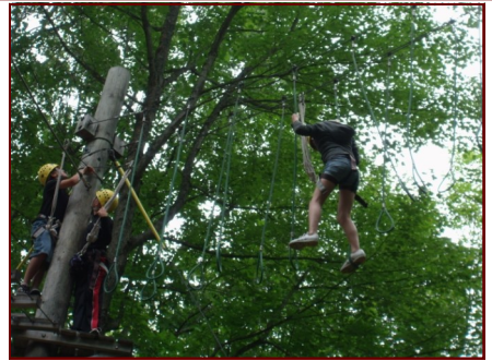
High ropes leaves the knees knocking a bit