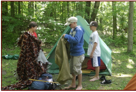
June Cran-Hill Immersion Camp