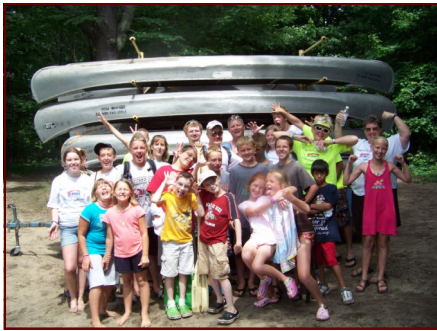
Those who made it to the end of the river—(don't ask about the rest)