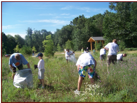
Removing invasive species during Bridging Out