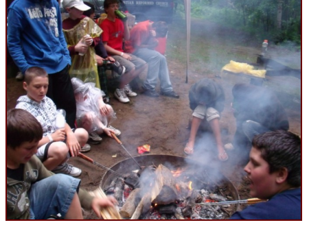
Cooking over an open fire at camp— "What's a little rain?"