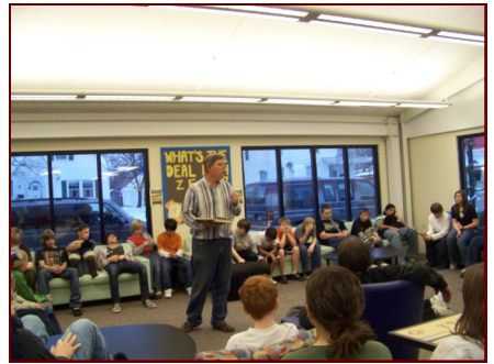
Drop-in provides a time to introduce kids to Christ at "couch time"

Will you help us serve Zeeland's at-risk youth?