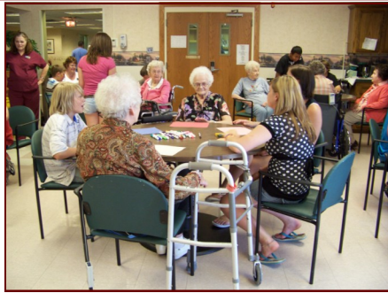
Intergenerational service project with members from Providence Healthcare